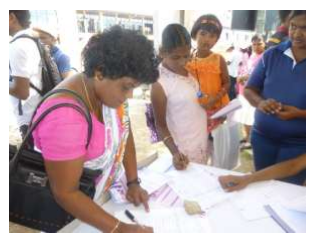
DOFEs at work.

Limited space within the MIC premises appears to be an issue common in all districts MICs, which cater to hundreds of migrant workers and their families every month. Certain MICs lack space for storage of equipment and documents, while a considerable number of MICs lack space to conduct safe labour migration related awareness programmes for migrant workers and their families inside the MIC. Some MICs, complained of having the