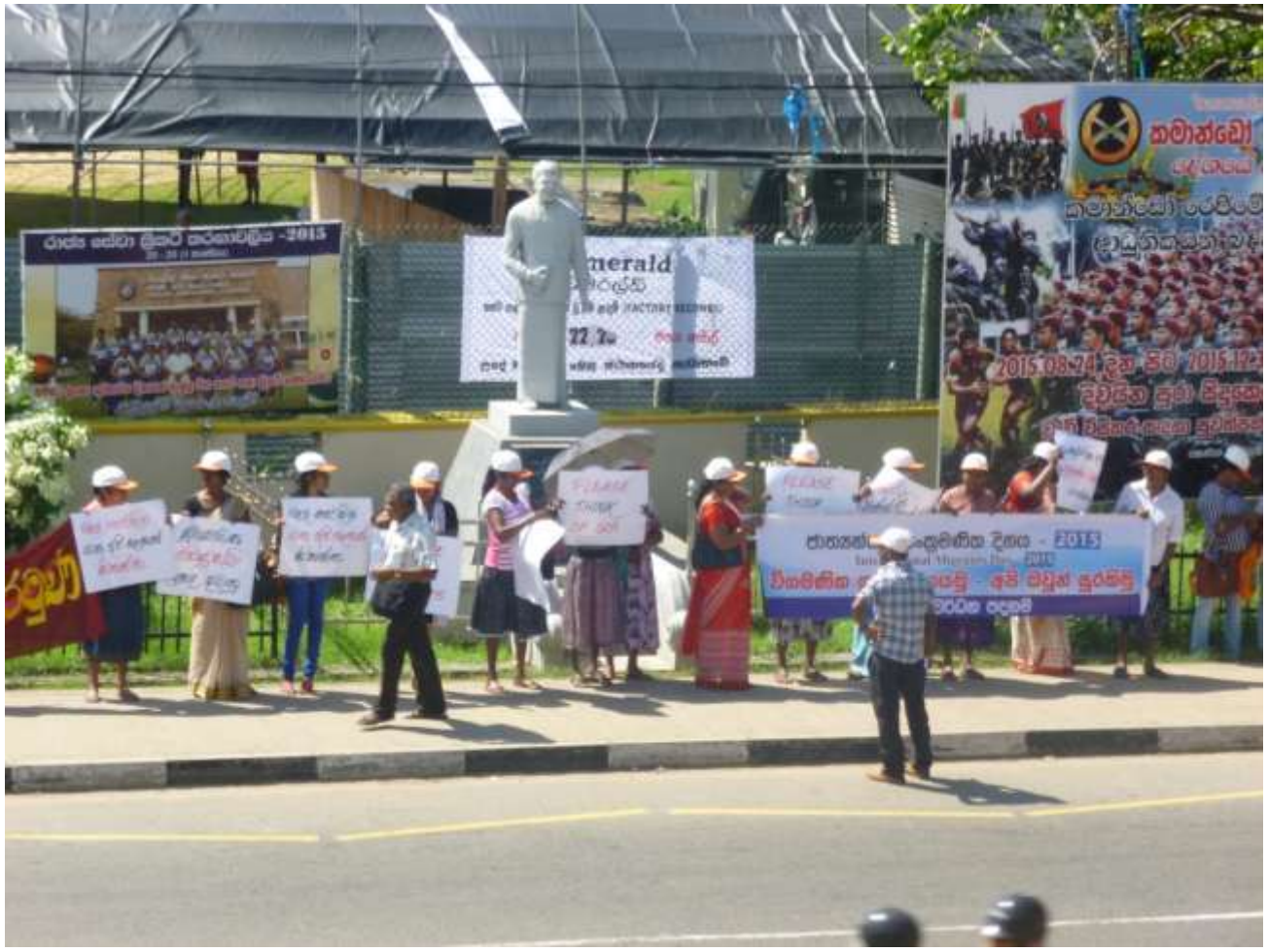
Migrant workers' day in Galle.

The package matters: Providing DO FEs with separate rooms and infrastructure without giving them the skills and knowledge on delivering their services to MWs, is not going to be successful. Only the combination of skills and the necessary infrastructure, is making the model a success.